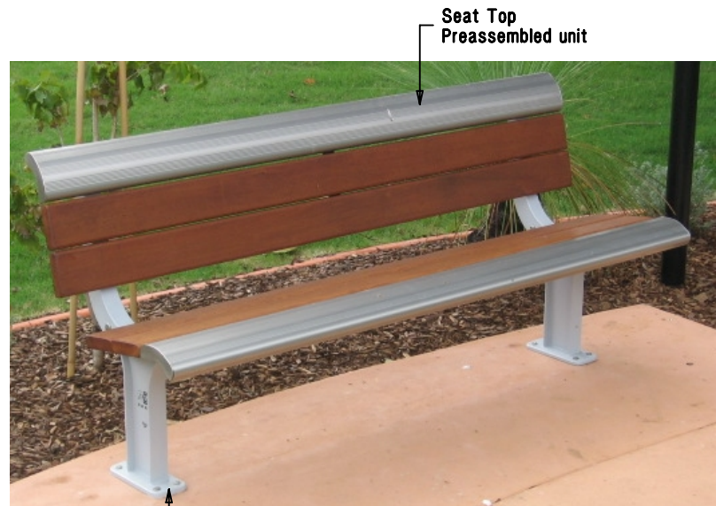
Legs Quantity and style as per order