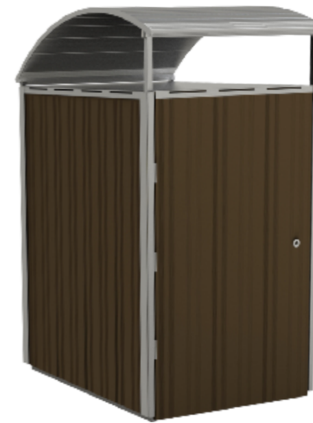
○ FRONT VIEW